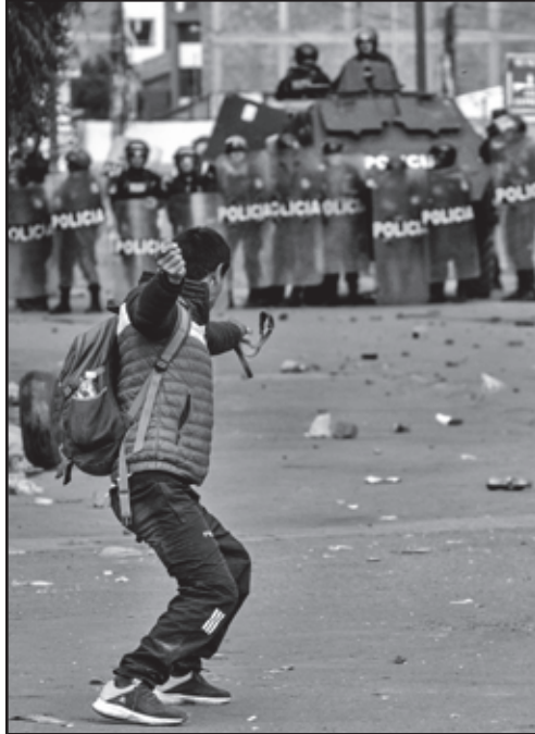
A protester faces off against riot police in Cusco, Peru.

Let us help your business reach its full potential!